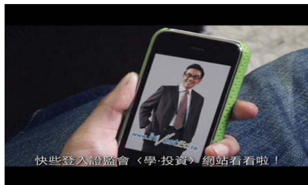
Investors can now view articles or videos on-the-go using the InvestEd iPhone App.

We continued to raise the public’s awareness on bond investing. “Smart on Bonds,” the interview series that Ming Pao Daily carries in print and podcast, continued to invite industry professionals and academics to discuss popular bond instruments and associated risks. Topics covered include how to trade in the secondary bond market, various risks of bond investing such as liquidity risk, interest rate risk and credit risk, how bonds may fit in an investment portfolio, and the differences between bonds and bond funds.