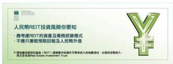
Bus seat stickers remind investors of the risks of RMB REITs.

In the May issue of InvestEd Intelligence , we also explained how investors could get the most out of their investment advisors, possible tax issues when investing in overseas products and common misunderstanding as to why trading of derivative warrants ends before they expire. Recognising that intermediaries are in a good position to communicate with investors, we reinforced our educational message on possible overseas taxes by issuing a circular to licensed corporations in June, urging them to share with their clients the message in the article. The Hong Kong Monetary Authority also sent out a similar circular to registered institutions or banks that carry on securities and futures business.