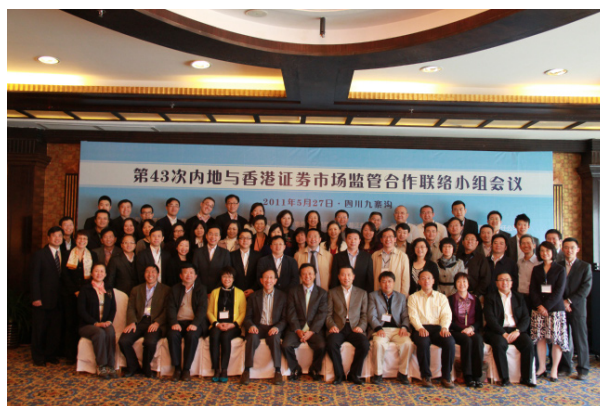
SFC representatives exchange views with Mainland regulatory and exchange officials at the 43rd Memorandum of Regulatory Co-operation meeting.

To promote Mainland-related initiatives that would benefit Hong Kong's financial markets, we maintained high-level dialogues with relevant regulatory authorities across the border. In May, we attended the 43rd Memorandum of Regulatory Co-operation meeting to exchange views on various issues concerning financial cooperation between the Mainland and Hong Kong with the CSRC, the China