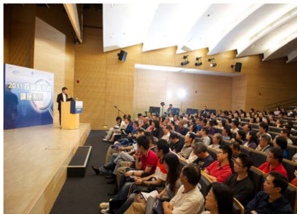
The 300-plus audience pays rapt attention to a speaker at an annual investor seminar we organise jointly with the Hong Kong Society of Financial Analysts.

While most IE video segments and articles have been made available on the InvestEd website, we continued to promote the use of the website via online games and Yahoo’s online promotion tools, which drew more than 10,000 visits during the quarter. With the launch of the updated version of our InvestEd iPhone Application in May, iPhone users now enjoy the benefit of portability to access InvestEd Intelligence and follow our IE activities.