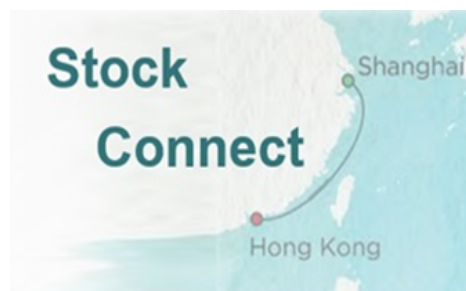
A dedicated section about Shanghai-Hong Kong Stock Connect was added to the SFC website in November

Upon the launch of Shanghai-Hong Kong Stock Connect 3 in November, a new section was added to the SFC website to facilitate public access to the latest updates and other relevant information about the programme.