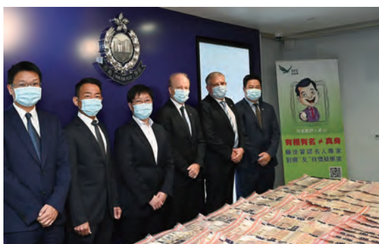
Press conference on joint operation with the Police against suspected ramp and dump schemes