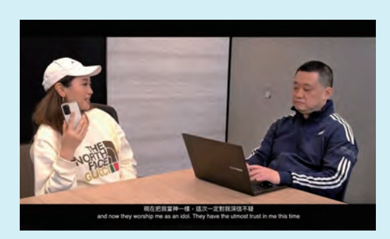
Video explaining a typical scam