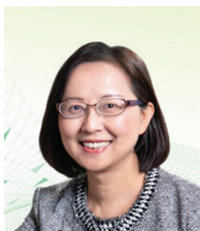
Agnes CHAN Sui-kuen