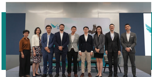
Building the Future: How Green Fintech is Transforming Financial Services seminar

We remain committed to talent development by hosting our annual student-focused sustainable finance seminar in July. Titled "Building the Future: How Green Fintech is Transforming Financial Services" this year, the seminar attracted over 100 students and emphasised the practical applications of green Fintech in the financial services sector. In addition to highlighting the catalytic role of technology in advancing sustainable development in the real economy, the event showcased the Hong Kong Green Fintech Map 2025 jointly developed by the Steering Group with the industry.