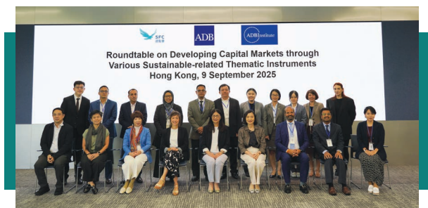
Roundtable on Developing Capital Markets through Various Sustainable-related Thematic Instruments

Senior regulators and officials from 12 jurisdictions in Asia shared insights on the trends and innovations in instruments such as green bonds, blue bonds and ESG funds. Participants, including experts from the Asian Development Bank (ADB), ADBI and the private sector, discussed how to facilitate the use of these instruments and mobilise transition finance.