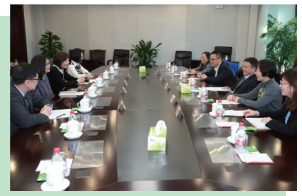
Meeting with PBoC and SAFE officials

To advance Hong Kong's unique position as the international financial centre connecting Mainland and international capital flows, we take an active part in Mainland-Hong Kong cooperation initiatives and hold regular discussions with the China Securities Regulatory Commission (CSRC) to enhance our supervisory and regulatory cooperation. The fifth biannual SFC-CSRC high-level meeting was held in May 2019 in Hong Kong and the sixth was held in November 2019 in Shenzhen.