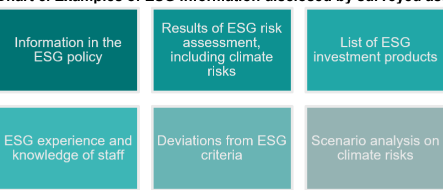
Chart 5. Examples of ESG information disclosed by surveyed asset management firms