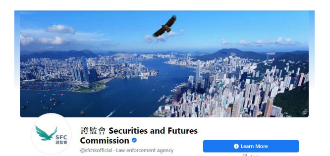
SFC Facebook page

We were a co-organiser of Hong Kong FinTech Week 2020 in November. Our senior executives delivered speeches and hosted panel discussions on regulatory issues related to the development of financial technology during the event.