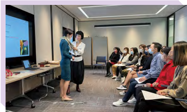
SFC Women's Network workshop