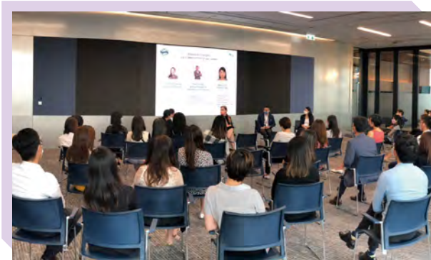
Internal sharing session