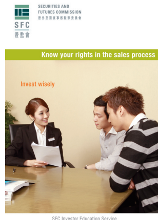
Through photo comics, this booklet guides investors through the sales process and remind them of their rights.

This quarter, we held 11 seminars for over 800 persons of various age groups – from university students to retirees – to help them understand how the market operates, how to manage investment risks and watch out for market misconduct, and why financial planning is important. Moreover, to facilitate continual training for secondary school teachers under the Business, Accounting and Financial Studies curriculum, we jointly organized a half-day seminar with the Education Bureau for over 150 teachers, covering key features and risks of popular investment products such as ETFs, ILAS, renminbi bonds, listed renminbi securities and the latest investor protection measures, namely the KFS and additional disclosure requirements with respect to the sale of investment products.