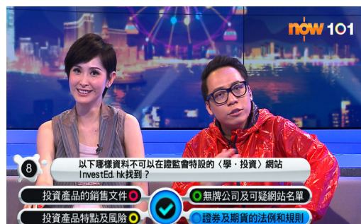
The “ATM” interactive quiz show on nowTV helps send investor education messages across through audience participation.

This quarter, we took an innovative approach to reaching the investing public by getting our messages across on a popular nowTV quiz show. The show “ATM” encourages