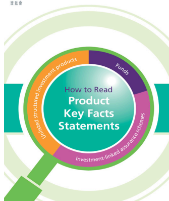
The updated KFS booklet informs readers of new disclosure requirements for product issuers.

In addition, we aired “Know the Protective Measures” short videos on now 101 and now Hong Kong channels from July to September to promote the KFS and the post-sale cooling-off arrangement for unlisted structured products.