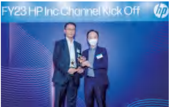
Awarded by HP Inc Hong Kong Limited