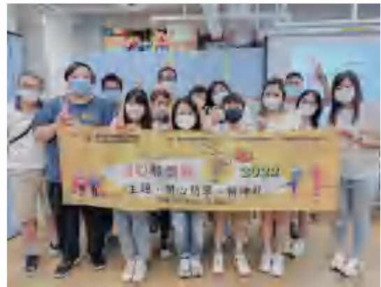
Mid-Autumn Festival Elderly Care Program