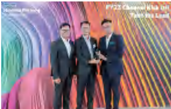
Awarded by Hewlett Packard Enterprise