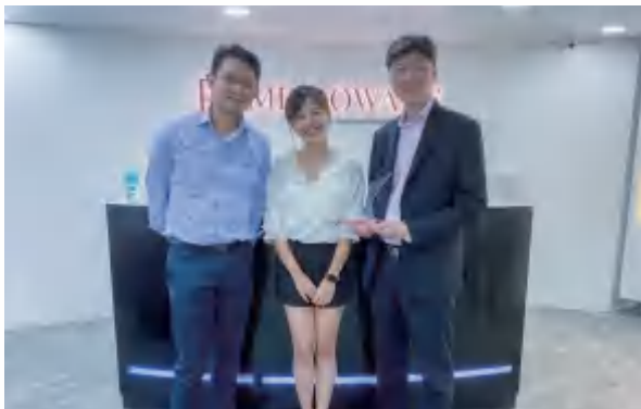
Barracuda Premier Partner