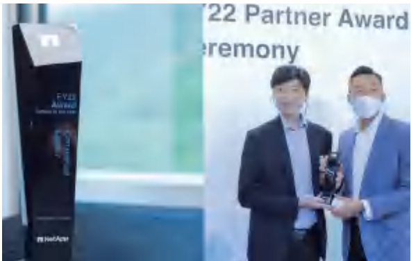
Awarded by Netapp